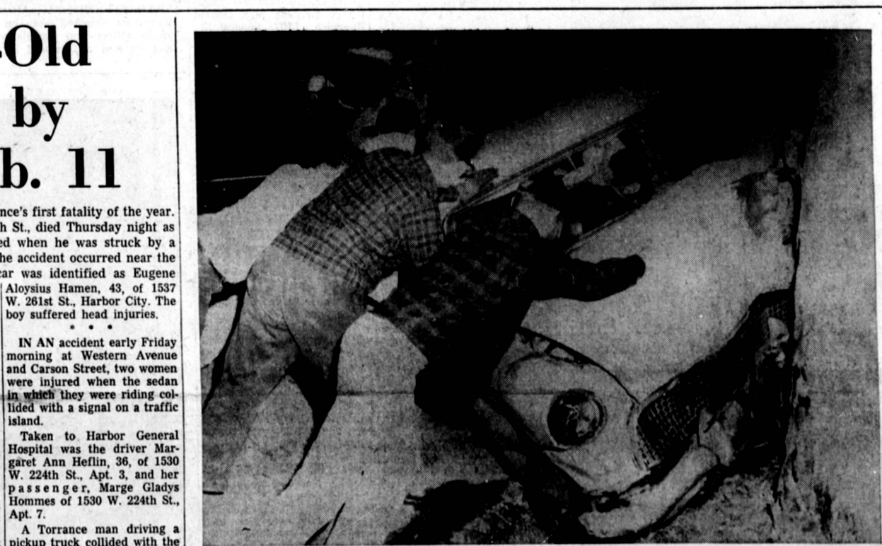
VEHICLE RIGHTED . . . Passersby join fire and police officers in righting a vehicle in which Nick Ranieri, 25, Compton, was lying with a broken leg and other injuries. The vehicle may have slammed into a tree at Western