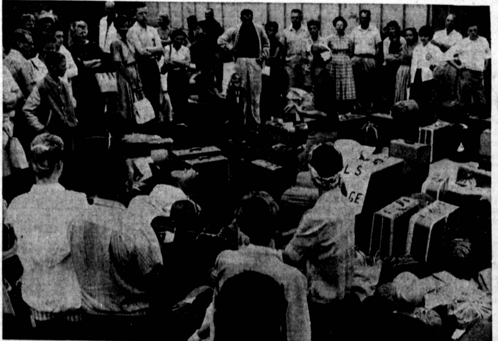
READY TO GO . . . The parking area adjacent to the YMCA building at 2080 Washington Ave. near Arlington Avenue and Plaza Del Amo looks like the rush hour at Union Station as families gather with baggage in hand to

sions each Summer. Here younger members of the Y get some first hand instruction in one of the many crafts classes offered during the year.