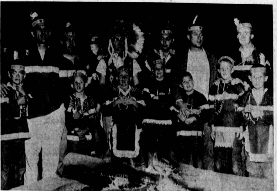
DADS AND LADS . . . Much of the activity sponsored by the Torrance YMCA puts emphasis on family programs, including many programs designed to include father and

affairs are part of the continuing, daily programs sponsored by the YMCA for local youth, financed by local funds only.