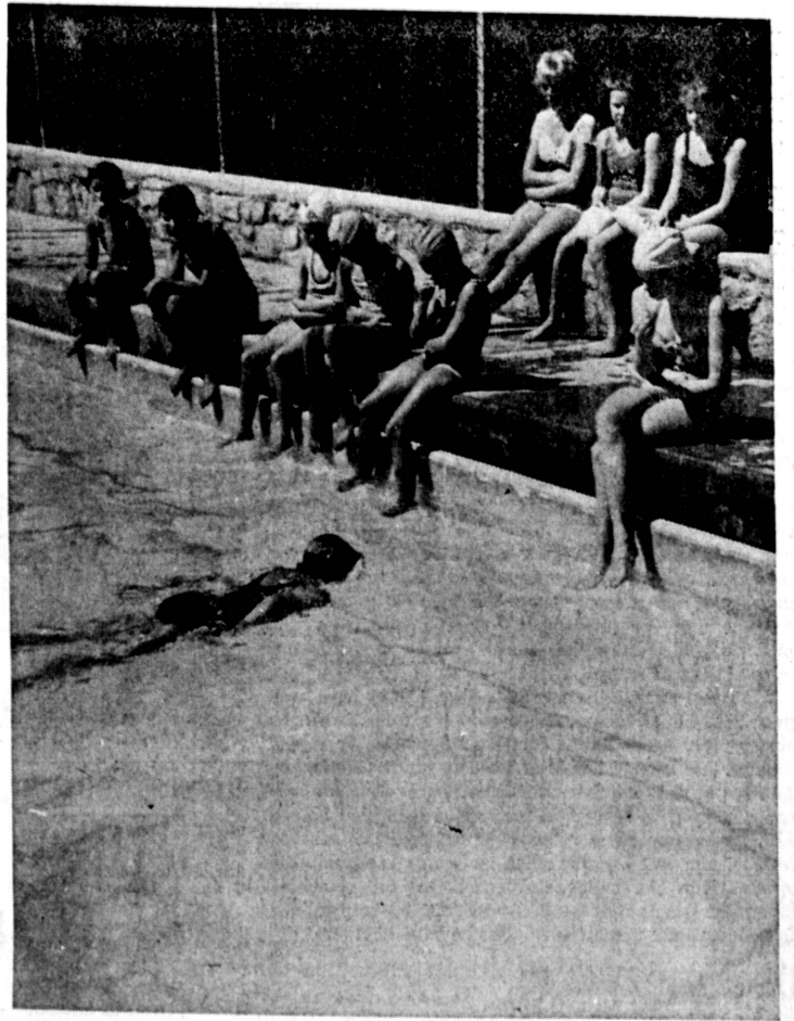
SUMMER FUN . . . YMCA-sponsored outings give plenty of time for recreation such as swimming shown here. In addition to such activities, the YMCA programs include inspirational study, and programs designed to enrich the lives of those young Americans joining in YMCA activities. Leadership training is one of the major benefits of YMCA programs.

rance YMCA conducts one of the nation's largest camping programs for its 3,000 families and more than 6,000 boys and girls who are regularly involved in YMCA activities.