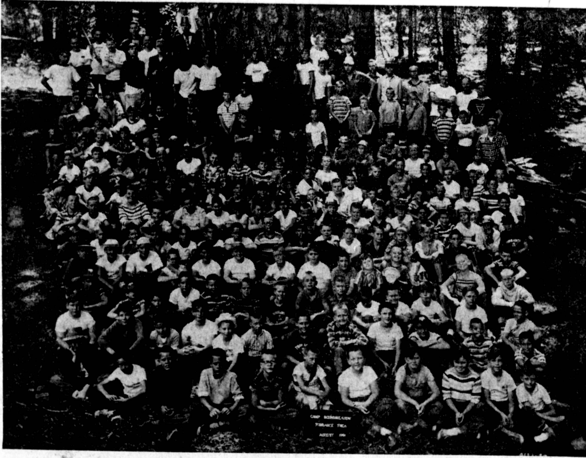
TYPICAL CAMPING SESSION . . . One of the two dozen camping sessions conducted by the Torrance YMCA each year is shown here at last year's Camp Round Meadows outing in the San Bernardino mountains. The Tor-

rance YMCA conducts one of the nation's largest camping programs for its 3,000 families and more than 6,000 boys and girls who are regularly involved in YMCA activities.