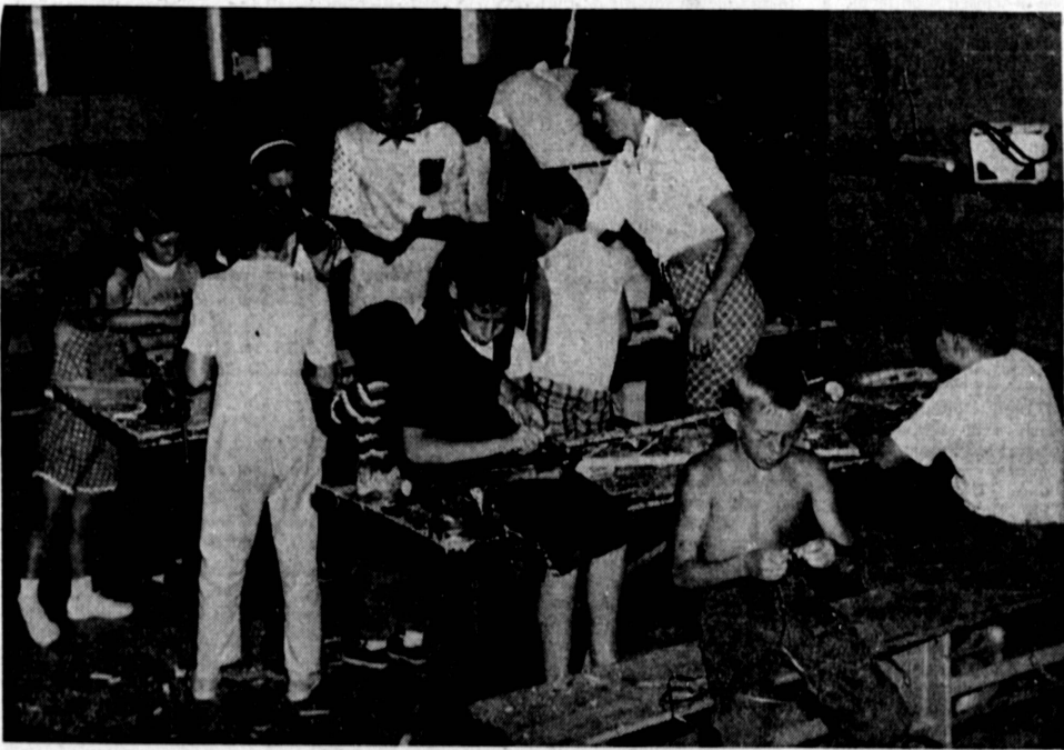
BUSY HANDS . . . The old adage about "idle hands . . ." doesn't apply when Torrance youngsters report to one of the many YMCA craft classes, either at the local YMCA headquarters or during one of the two dozen camping ses-

sions each Summer. Here younger members of the Y get some first hand instruction in one of the many crafts classes offered during the year.