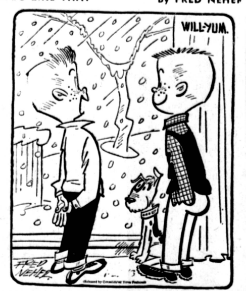
"Boy! Wouldn't you like to be caught in a candy store on a night like this!"