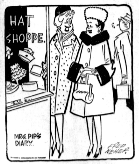
"A new hat is a tonic to me . . . it gives me enough strength o buy a dress, shoes and purse to go with it.