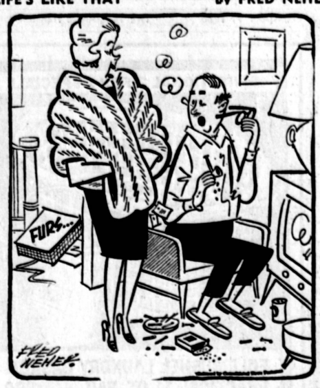
"But I did ask you at breakfast . . . you said all we needed was to have to make payments on a fur!"