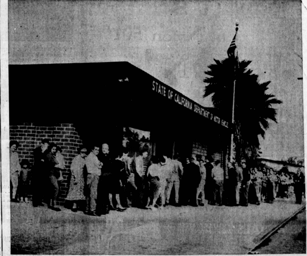
last day before penalties went into effect. Late comust now pay the penalties.