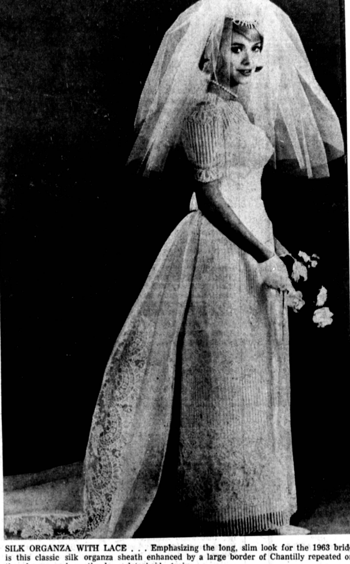
SILK ORGANZA WITH LACE . . . Emphasizing the long, slim look for the 1963 bride is this classic silk organza sheath enhanced by a large border of Chantilly repeated on the sleeves and on the long detachable train.

All these and many more will be paraded at Friday eve-ning's show for the South Bay bride of 1963.