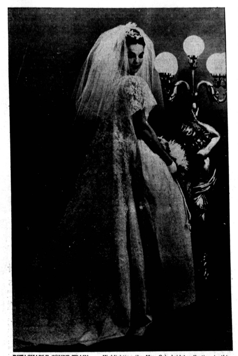
DETACHABLE COURT TRAIN . . . Highlighting the May Co's bridal collection is this new lace cape which forms the cap sleeves for the gown and falls into the court train. It is worn over a bell-shaped gown of taffeta with a lace over taffeta front panel.