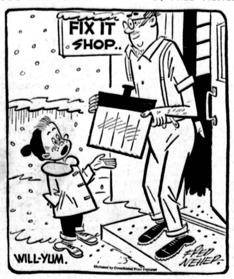
...an' take all winter to find a handle!