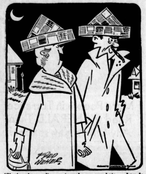
always after me to make my own hats . . . how d you like yours?"