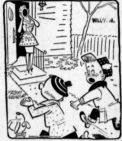
voice off Telstar