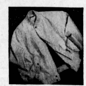
MARTIN OF CALIF.

CASUAL JACKET—enjoy your leisure with this finely detailed jacket. Knit collar, cuff, waistband. from 17.95