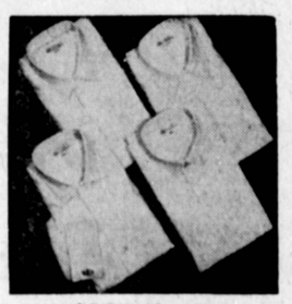
ARROW and KENNINGTON

ror many a year, people whe have a good feeling about things to give have chosen Pendletons—always 100% virgin wool.