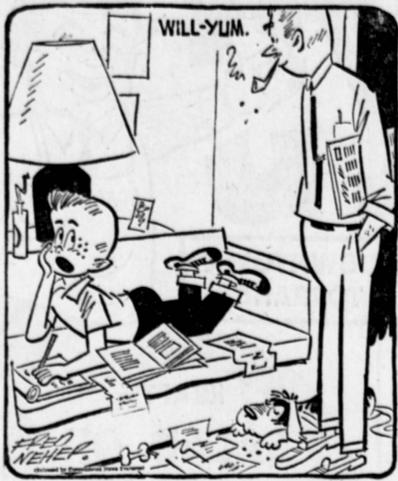
"I'm to write a composition on why I like Shakespeare . . . why couldn't she make it on Mickey Mantle or The Green Bay Packers!"