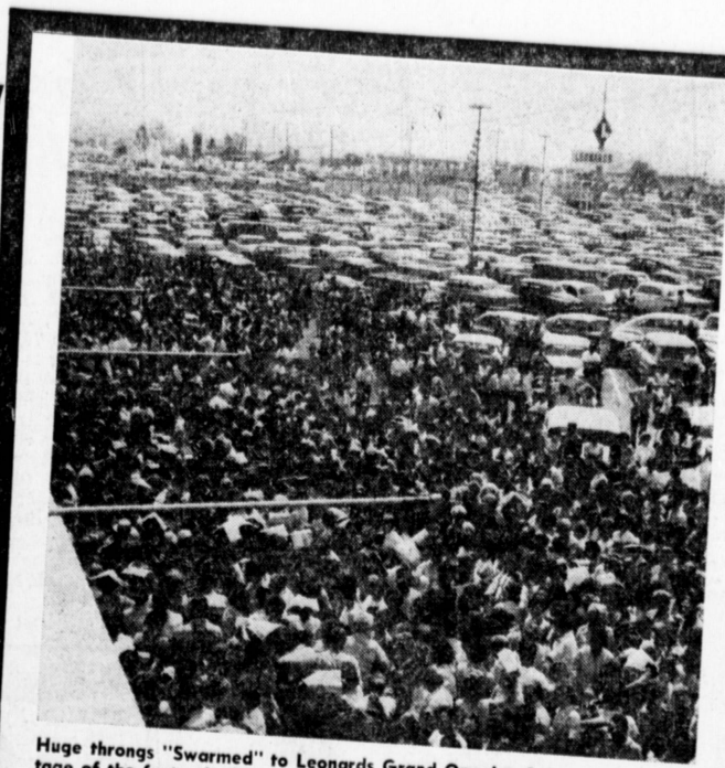
Huge throngs "swarmed" to Leonards Grand Opening Sale to take advantage of the fantastic "buys." The fabulous crowds (pictured above) made this event the most successful in Leonards entire history. Parking lots were jammed! . . . and patrons kept coming until the final minute of closing time! By "Popular Demand" the Grand Opening Sale is being held over for 4 more Big Days!