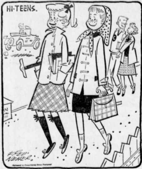
"What I like best about democracy... schools close Election Day!"