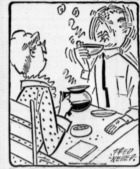
ads said, 'For that quick start'! 'The

as the author claims, entirely umented cover and support our ef-forts, how then can we fail? Perhaps I expect too much of the politicians I help to Your pen coupled with our voices may well be the team that wins in this dirty game elect, but to me the charge of being pro-Communist is far too serious to be dis-missed with a simple counterbetween decency and filth.