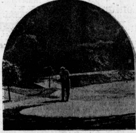
...overlooking the Los Verdes Golf Course.

Here in the heart of the once prized Spanish land grant, Rancho Palos Verdes, MonteVerde offers prestige homesites with panoramic views that stretch from Catalina Island to the Malibu Coast — that border the site of a magnificent 18 hole golf course, which will begin construction in 1963.