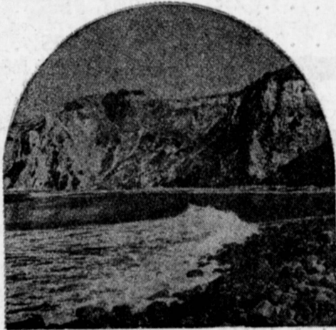
...kissed by the sea...