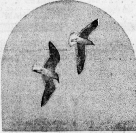
...open to the sky...