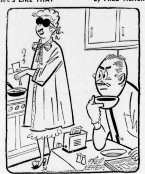
"If I take it off I'll never get back to sleep again!"