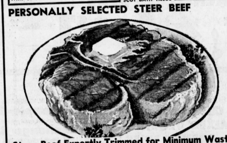
PERSONALLY SELECTED STEER BEEF

FILL YOUR FREEZER WITH THESE EXTRA LOW PRICED ITEMS, PLUS MANY MORE! These Prices Also Effective at NORLEY'S MKT.