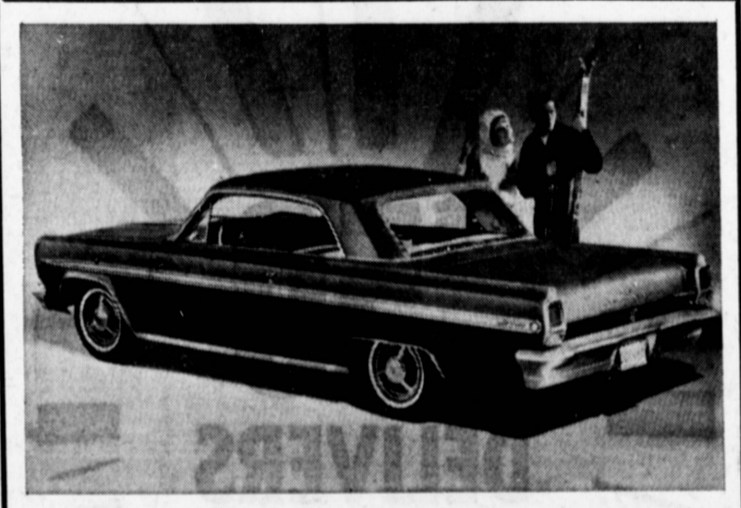
1963 OLDSMOBILE "JET FIRE" HARDTOP COUPE

See the Complete Range of Models and Extras! WE'RE OFFERING EXCEPTIONAL DEALS ON '63's . . . SO YOU CAN ORDER NOW FOR EARLY DELIVERY!