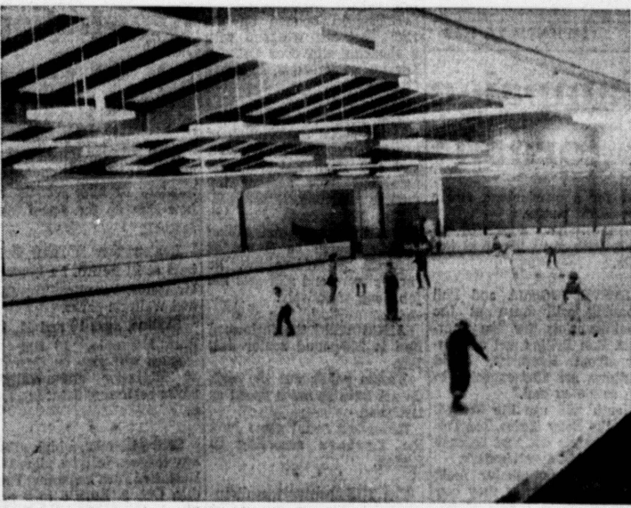
WARM WEATHER TIP... The new Olympic Ice Arena at 23770 S. Western Ave. is open daily and offers skating fans a choice of facilities, including parties, instruction, and open skating. John Haretakis' Silver Skates Restaurant is under construction, and when completed will offer diners a magnificent view of the skating floor.

The original vapor droplet for a raindrop or snowflake may, by joining others, multiply 8,000,000 times before it reaches the ground.