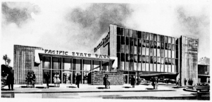
FACILITIES ARE IMPORTANT and Pacific State Bank has them, in abundance. A new main office in Hawthorne is "customer-designed" for friendliness with efficiency. Banking here is a pleasure. Service windows are cozy and confidential. Completely air-conditioned, of course.