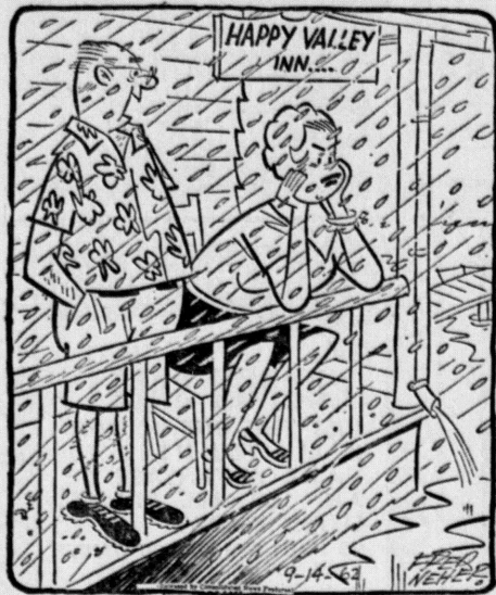
"Better be thinking up some lies for the postcards we're sending back home."