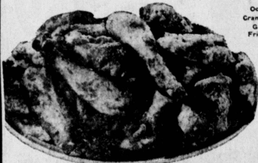
Ocean Spray Cranberry Sauce Great With Fried Chicken