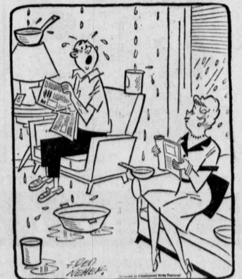
"According to the paper... it's the wettest month on record."

(Flashbulbs pop, cameras whir and chairs are overturned, but loudest are the cries for order. They usually are.)