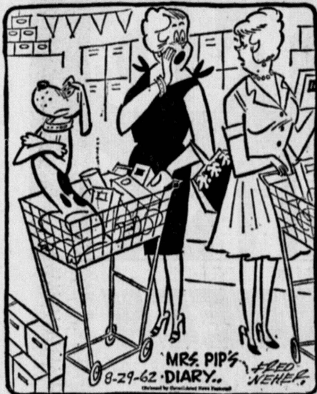
"He insisted on coming along so I wouldn't forget his dog food!"

UTILITY Reg. 3.95 2.97 Gal. EASY SPREAD GLOSS FINISH 25 colors and white. 4.68 Gal.