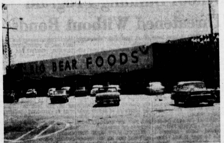
NEW MARKET . . . Big Bear Foods opened last week at 3860 W. Sepulveda Blvd. The new market, managed by Tom Eggleston, features everyday low prices and variety of high-quality foods, meats, and produce. The store is currently celebrating its grand opening in Torrance.

Local arrangements were conducted by Stone and Myers Mortuary.