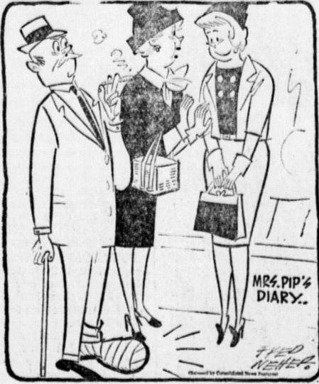
"It was a bowling accident . . . he dropped a ball on his foot when the blonde in the next alley split her skirt."