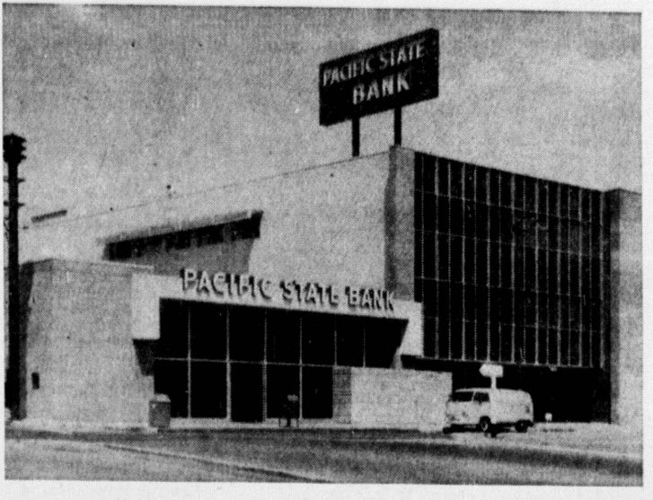
FACILITY READY . . . Newly expanded and remodeled offices of Pacific State Bank in Hawthorne opened yesterday following ribbon cutting. The grand opening featured movie stars and baseball players, as well as tours of the new facility. The bank will open a new Torrance office in the Carson area later this year.