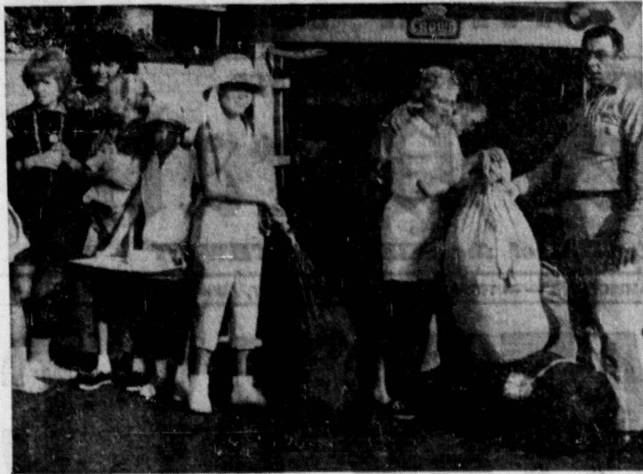
LEAVE FOR CAMP . . . Girl Scouts from throughout Torrance departed Friday morning by bus for a Girl Scout camp at Glendora. The group will be returning to the city on Tuesday after five days of fun and activity during the annual Central Torrance day camp. About 200 girls boarded buses at 9 a.m. Friday for the trip.