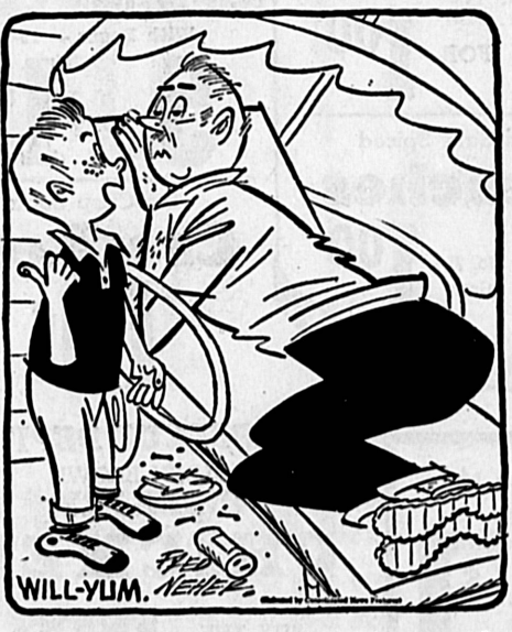
'Mom finally got the car in the garage . . . the guy next door wants to talk to you about it."