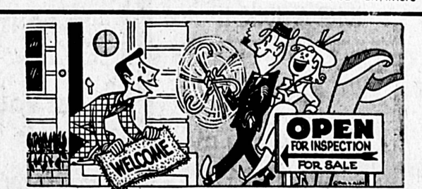
We Welcome Your Visit to Our Open Houses OPEN HOUSE 1 TO 5:30

Your Listing - Your Sale - Your Pur-chase - Your Escrow - Your entire transactions are handled by cap-able, courteous, dependable personable, courteous, dependable person-nel from beginning to end. No bet-ter service rendered—anywhere