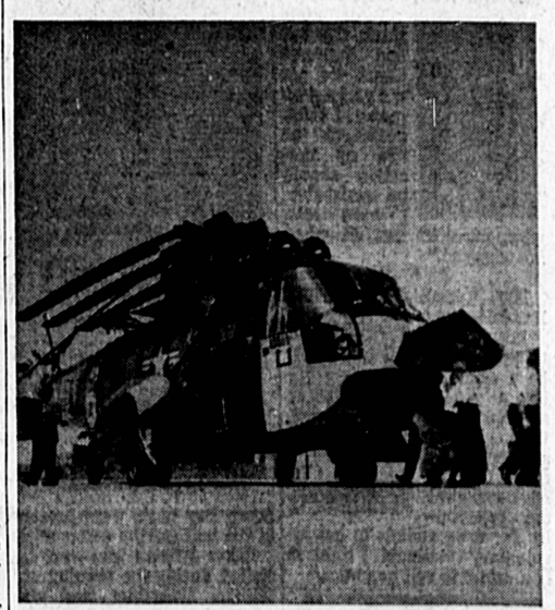
TORRANCE VISITOR . . . Some 400 employees of Ryan Aeronautical Co. got a look at navigational equipment installed in a HSS-2 helicopter. The local firm has made the navigational equipment for about three years but many employees had never seen it installed. Thursday was believed to be the first time this type helicopter has landed at an industrial firm. was believed to be the that had landed at an industrial firm.