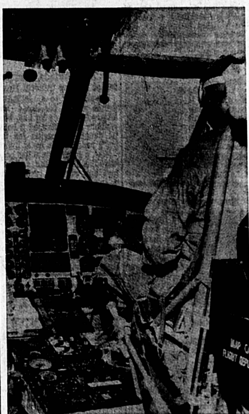
HELICOPTER CONTROLS . . , It was all in a day's work for this pilot, shown at the controls of a Navy HSS-2 twinturbine Sikorsky helicopter Thursday when he set the big machine down at the electronics division of Ryan Aeronautical Co., 2750 W. Lomita Blvd. The helicopter flew to Torrance from Ream Field near San Diego.