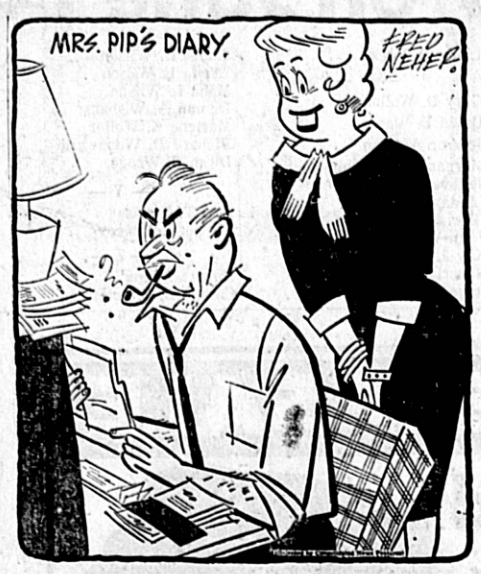
're in debt to the limit . . . why not handle it like the government? . . . raise the limit."