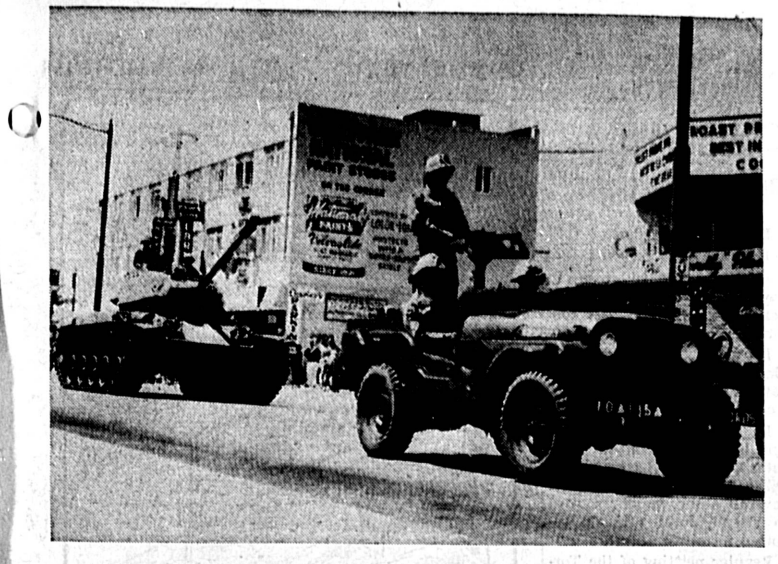
ON THE GROUND . . . Rumbling tanks lent an awesome note to the Armed Forces Day Parade here yesterday as they lumbered along the parade route along with majorettes, foot soldiers, space vehicles, and military and civilian dignitaries. What would a military parade be without a tank? And, bands and marching units.