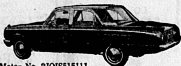
Motor No. 2JOISS15111

CASH PLAN $1919 FULL CASH PRICE PLUS TAX & LICENSE FINANCE PLAN ONLY $300 DOWN and 36 Months at $56.89