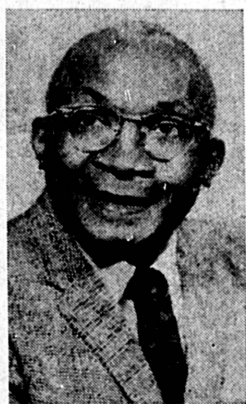
JESTER HAIRSTON To Conduct Spirituals

Since organizing his own choir in 1943 in the Los Angeles area, he has arranged and conducted the choral background music for "Duel in the Sun," "Portrait of Jenny," "Carmen Jones," and many other outstanding films. Hairston has played many