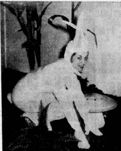
CHILDREN'S WEEK . . . "Here Comes Peter Cottontail" on his way to spend Children's Week at the Broadway Del Amo. He will have an Easter surprise for each youngster who visits him on Saturday, Monday, Thursday, Friday and the Saturday before Easter.

Starting next Saturday, Children's Week will go into orbit at the Broadway Del Amo where space ships and balloons will fill the air.