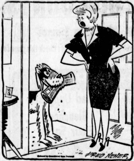
"How many times have I told you that all deliveries are in the rear?"