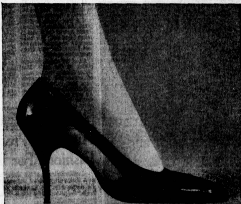
Our latest black patent leather