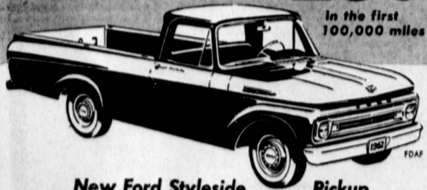
New Ford Styleside Pickup

costs $32 less than Chevy's pickup.* Also, latest tests have shown a Ford Six Pickup can save $228 on tires alone during 100,000 miles of operation. Total: $260!