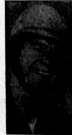
PARNELLI JONES Ascot Favorite

Heading up an Indianapolis Speedway-veteran cast at Ascot Park today will be Indy co-rookie of the year, Parnelli Jones. The Torrance driver will oppose 500 champion and record holder A. J. Foyt and several other renowned brickyard pilots in a 40-lap USAC national championship midjet car race.