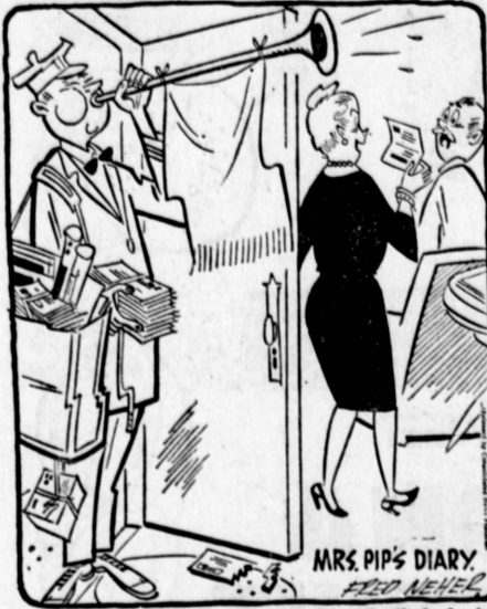
MRS. PIP'S DIARY

"It's a birth announcement . . . the Gulleys finally had a boy!"