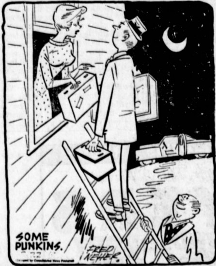
"Do I think father will be mad? Who do you think is holding the ladder?"