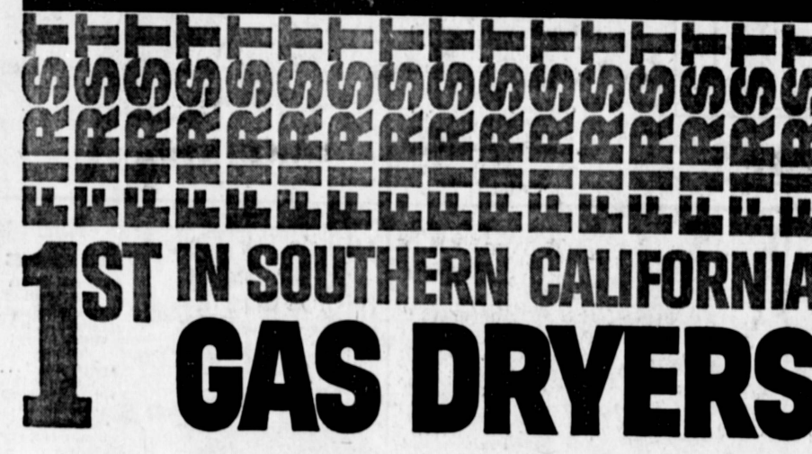
IST III Dates-Actual sales figures show that more Southern Californians buy gas dryers than any other kind.

1st in Installation Savings-Gas dryers require no expensive wiring.