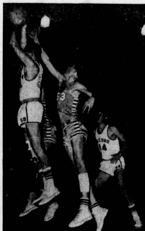
GOING UP.. North High gunner leaves the ground for a two-handed jump shot in the Saxon's win over Leuzinger on Friday. The contest marked the end of the basketball season for the North combo.

South jumped into a 21-17 halftime lead, but Redondo came back to go ahead at halftime.