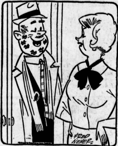
"You'll never guess in a hundred years who I saw on the way home!"