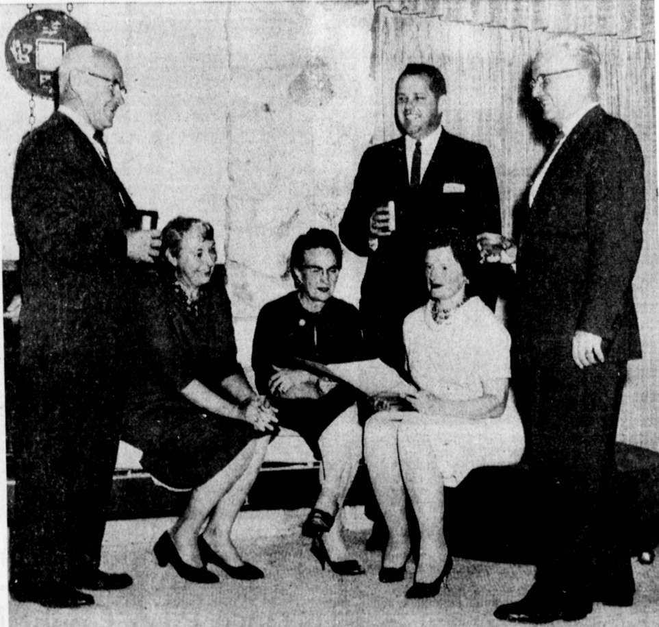
ANNIVERSARY CELEBRATION . . . These board members of the Little Company of Mary Hospital gathered this week to discuss plans for the Founders' Day banquet to be held next Wednesday evening, Jan. 31 at the Plush

Are you going steady? Making marriage plans? If so, send for ANN LANDERS' booklet, "Before You Marry—Is It Love Or Sex?" enclosing with your request 20 cents in coin and a long, self-addressed, stamped envelope. Ann Landers will be glad to help you with your problems. Send them to her in care of this newspaper enclosing a stamped, self-addressed envelope. Copyright 1962, Field Enterprises, Inc.