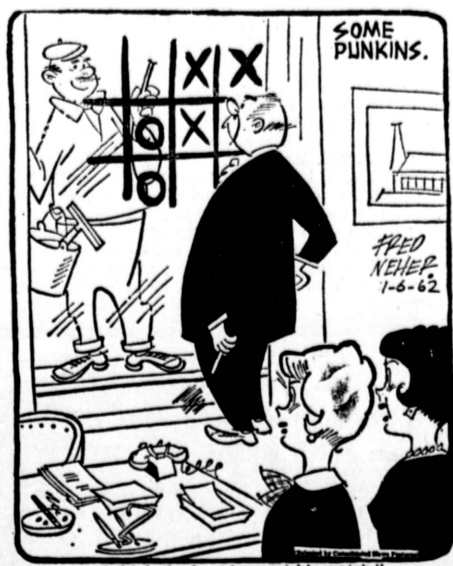
"I think the boss has met his match."