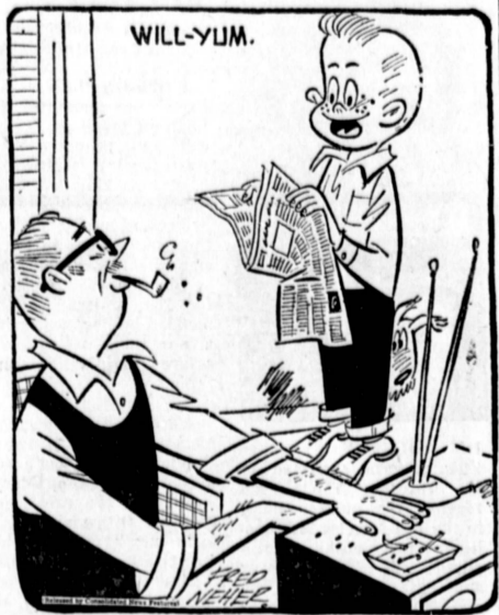
"The paper calls for snow... by advancing me a quarter you can reserve my services for shoveling our walk."