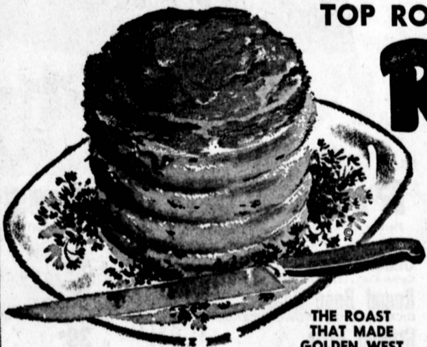
THE ROAST THAT MADE GOLDEN WEST FAMOUS!