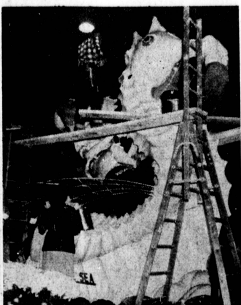
STARTING OUT . . . Workers climb scaffolds, glue pots and flowers in hand, to begin placing the thousands of blossoms which will give the city's "Seahorse" float its colorful finish for Monday's parade. When completed prior to the parade, the entire surface will be covered with blossoms.