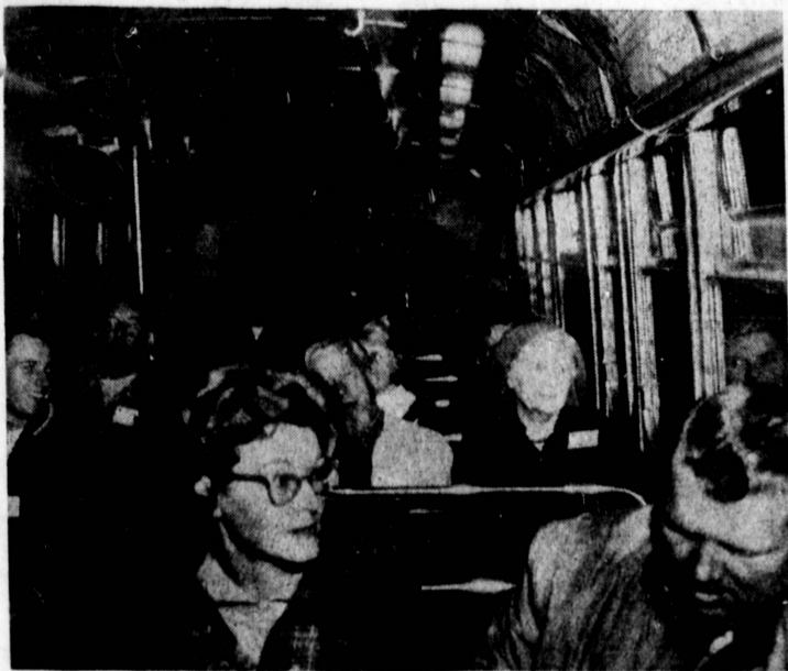
ON WAY TO WORK . . . Volunteers from all sections of the city are shown as they left by chartered bus Friday evening for Pasadena where they began putting final touches on the city's float for the Tournament of Roses parade next Monday. Operations will continue until late Sunday or early Monday when the float is pulled into line for the spectacular.